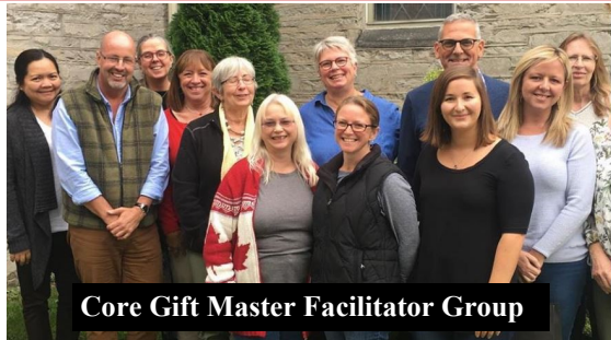
Core Gift Master Facilitator Group

“The meaning of life is to find your gift. The purpose of life is to give it away!”